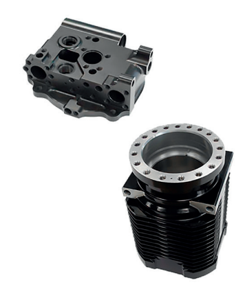
Two parts produced by High-Tech engineering